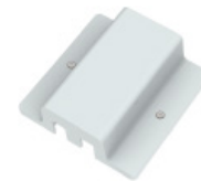
K605 Single/Two Circuit Floating Canopy Finish: WH/BK