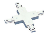
K611 Single/Two Circuit X-Connector Finish: WH/BK